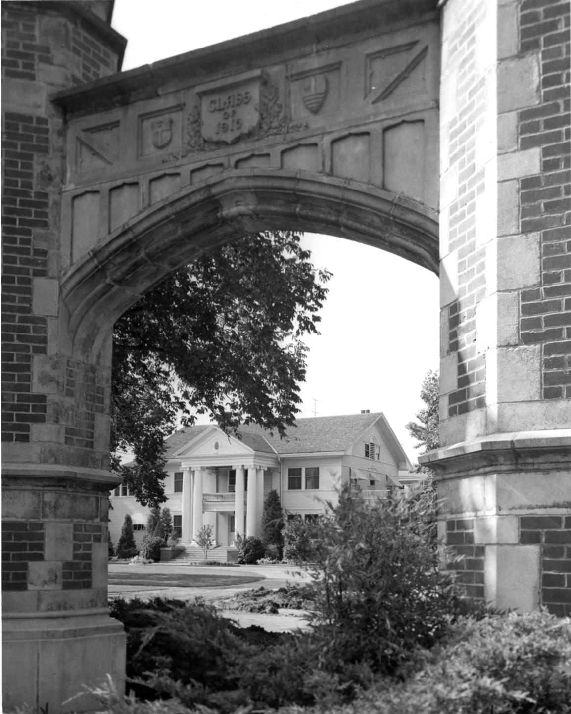
President's House (Boyd House – OU)